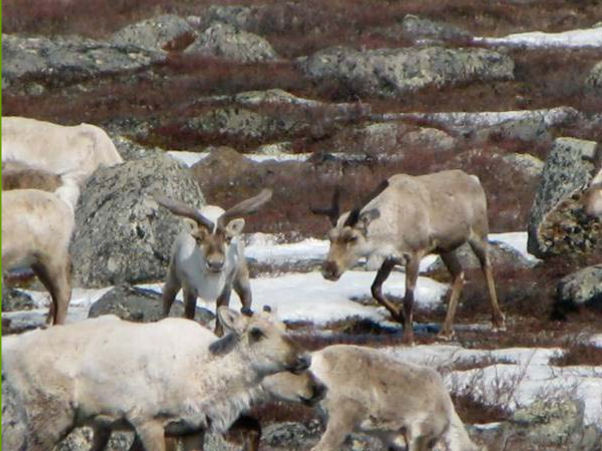
Bathurst Caribou near Ekati, May 2007