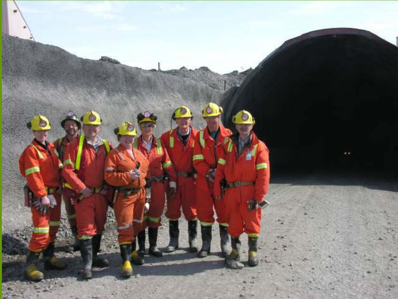
Ekati Site Visit in May 2007