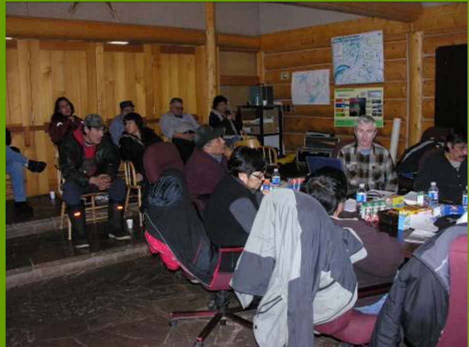
Agency Director Visit to Lutsel K'e--March 2008

“The Monitoring Agency shall report annually.... to BHP, the Minister, and the GNWT. All reports of the Monitoring Agency shall be made available to the Aboriginal Peoples and the general public.”