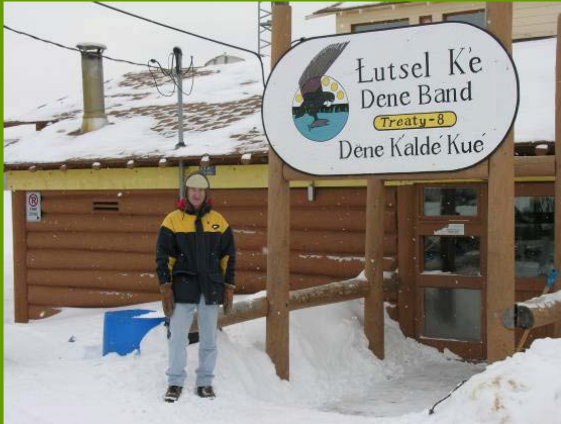
Director Visit to Łutsel K'e in March 2008