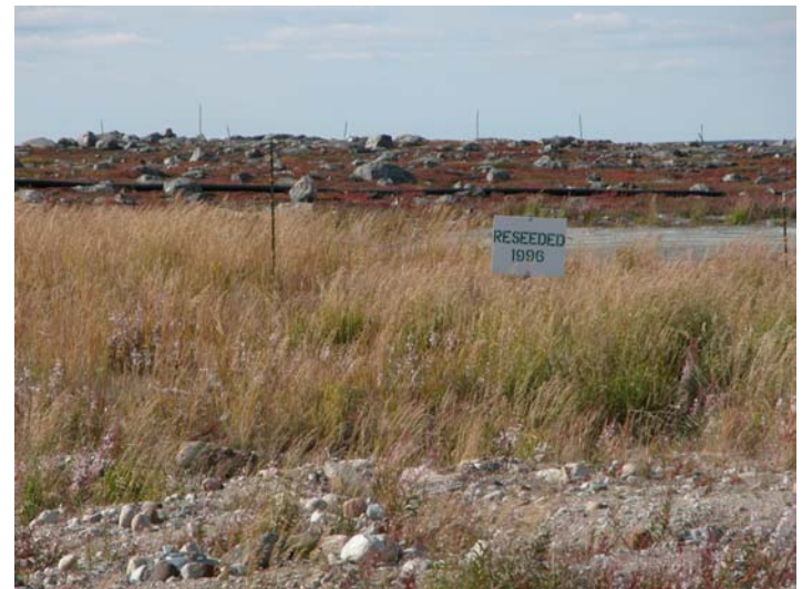
of closed mine areas