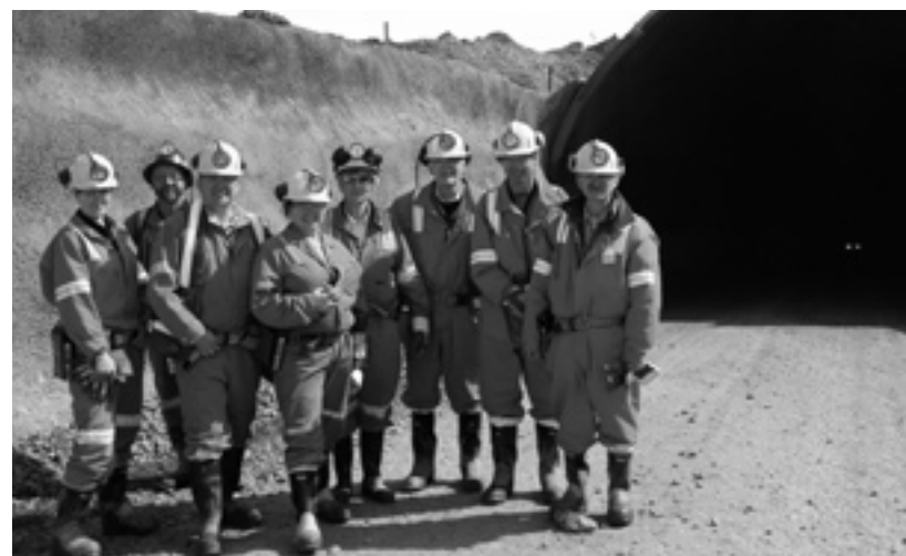
Agency directors and BHPB staff at the underground portal at Ekati.

We look forward to reporting back to our Society Members on these topics and others as they develop, and to another year of good environmental performance at Ekati. ■