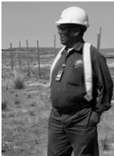
Elder at Ekati site visit.

Aboriginal Peoples to develop a method of documenting the suggestions and concerns of Aboriginal Peoples who visit the site. Presently, one cannot determine what information and experiences were gained from site visits and consultation efforts, how this TK was used, what information was disregarded and why, and how the company deals with contradictory information. We are pleased to learn that BHPB is in the process of producing a TK report documenting how TK has been and can be used at the mine site. It is also developing a multi-year TK strategy that will continue with existing projects (Naonayaotit Traditional Knowledge Project and the Caribou and Roads Project). We look forward to receiving more information on these initiatives. ■