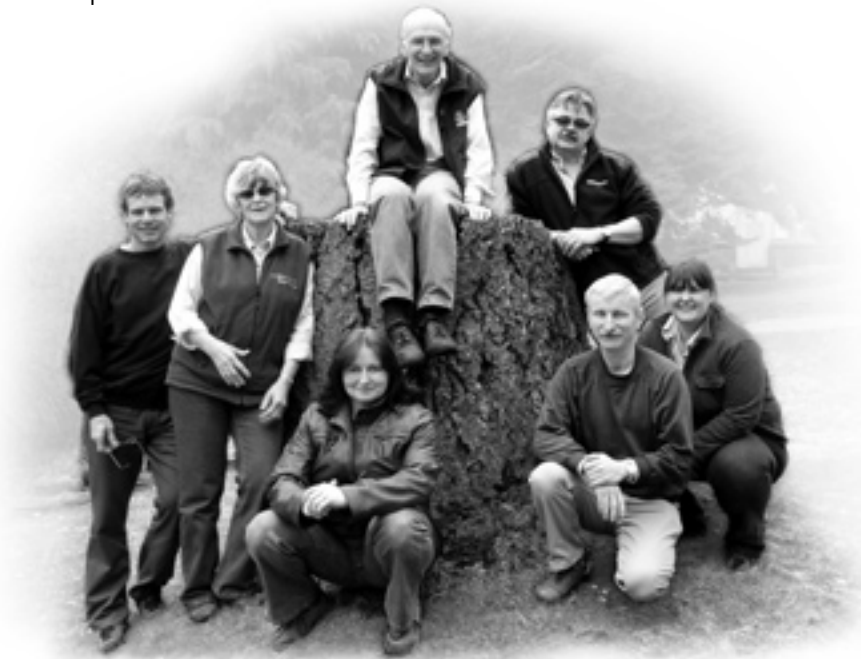
Agency directors, 2008

Proposed Activities: Maintain current staff and benefit levels. ■