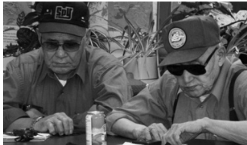
Elders at an Agency event.

In 2007, an archaeology field program was undertaken in areas of proposed land-based exploration activity. This is the fourteenth year of the program, and a North Slave Metis Alliance (NSMA) member took part in the fieldwork. A total of 14 advanced exploration locations were assessed from the air and nine of these were examined on the ground. One new archaeological site was discovered. This brings the total of recorded sites on the BHPB claim block to 200.