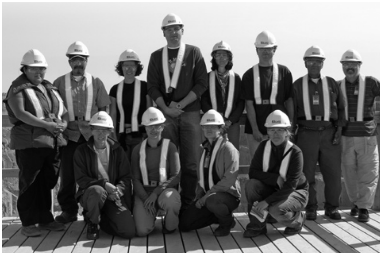
Regulators at Ekati site visit.

In our view the GNWT has contributed significantly to improving the Air Quality Monitoring Program (AQMP) at Ekati. However, the GNWT could contribute more technical information to the ICRP Working Group process through its wildlife staff. As the ICRP planning has progressed we have not observed as much coordination among the GNWT divisions as we would suggest is necessary to ensure an appropriate GNWT perspective is contributed.