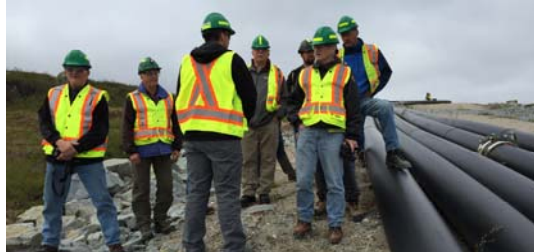
Agency Directors at the Leslie Lake effluent discharge point .

June 2016, the Agency conducted an annual site visit to the Ekati Diamond Mine. We visited the following areas: