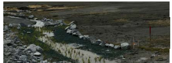
LLCF Cell B Revegetation

Agency staff and Directors had a good site visit.