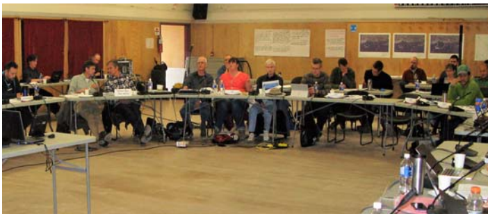
WLWB water licence technical session for DDEC's Jay Project in Behchoko, October, 2016.

Based on the Tłı̄ch̄ Government concerns on the amendment to the main licence application, DDEC withdrew their application to extend the term of the water licence. Therefore, the water licence will continue expire in 2021.