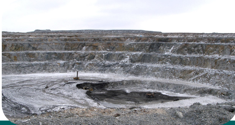
Left: View of the industrial composter in the solid waste facility at the Ekati site. Right: Blasting of the ore in Pigeon pit.