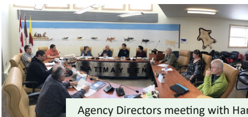
Agency Directors meeting with Hamlet.

The Agency met with staff from Kitikmeot Inuit Association, and for the first time, the Hamlet of Kugluktuk (Mayor and council). The Agency heard a lot about local concerns, including water quality and shifting wildlife patterns.