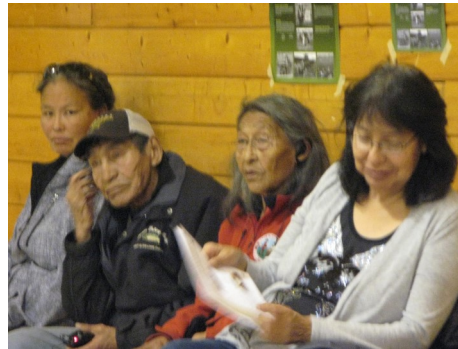
Members of the public at the community Open House.

The Community Open House was held at the Z'ah Lockhart Community Hall. Feast began at 5:30 pm followed by an Agency Presentation. Several people joined us for dinner or to hear an Agency presentation about us and Dominion Diamond Ekati Corporation's environmental monitoring programs.