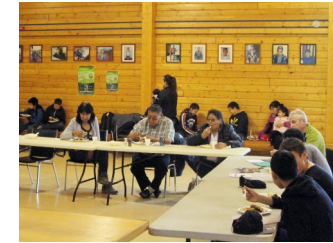
Community members enjoying the feast of moose stew and bannock before the presentation.

The Agency heard concerns about the new developments at Lynx and proposed for the Jay Pipe. People are concerned about impacts on caribou.