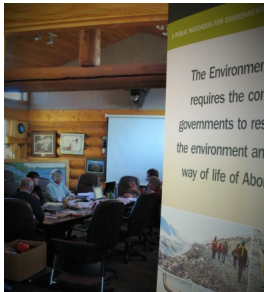
Board Meeting at the LKDFN Council Chambers.

The Agency discussed its regular business items, such as updates from each board member, updates activities at Ekati Mine, and the financial and variance reports.