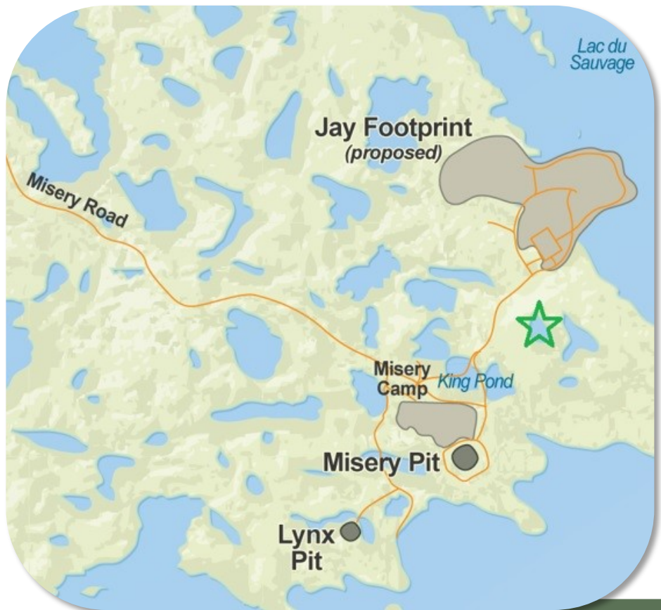
The green star shows the location of the planned Point Lake development. Map Courtesy of Dominion Diamond Mines ULC

Dominion continues to look for the best ways to engage with communities on this project. The Agency will inform our Society Members of updates on engagement as they become available.