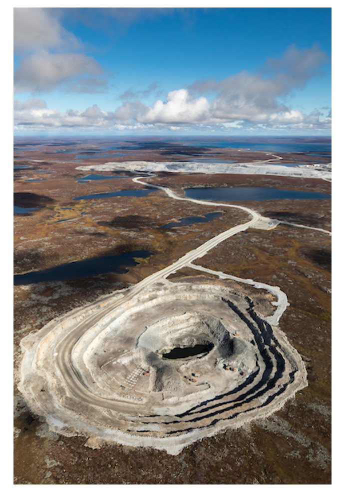
Lynx Pit (August 2018)