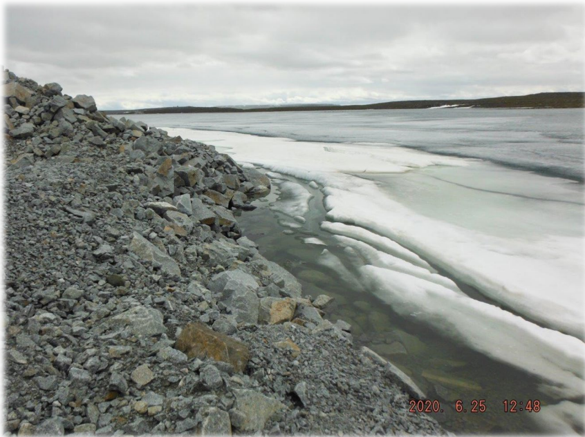
Cell E Looking from Dyke D – June 25, 2020