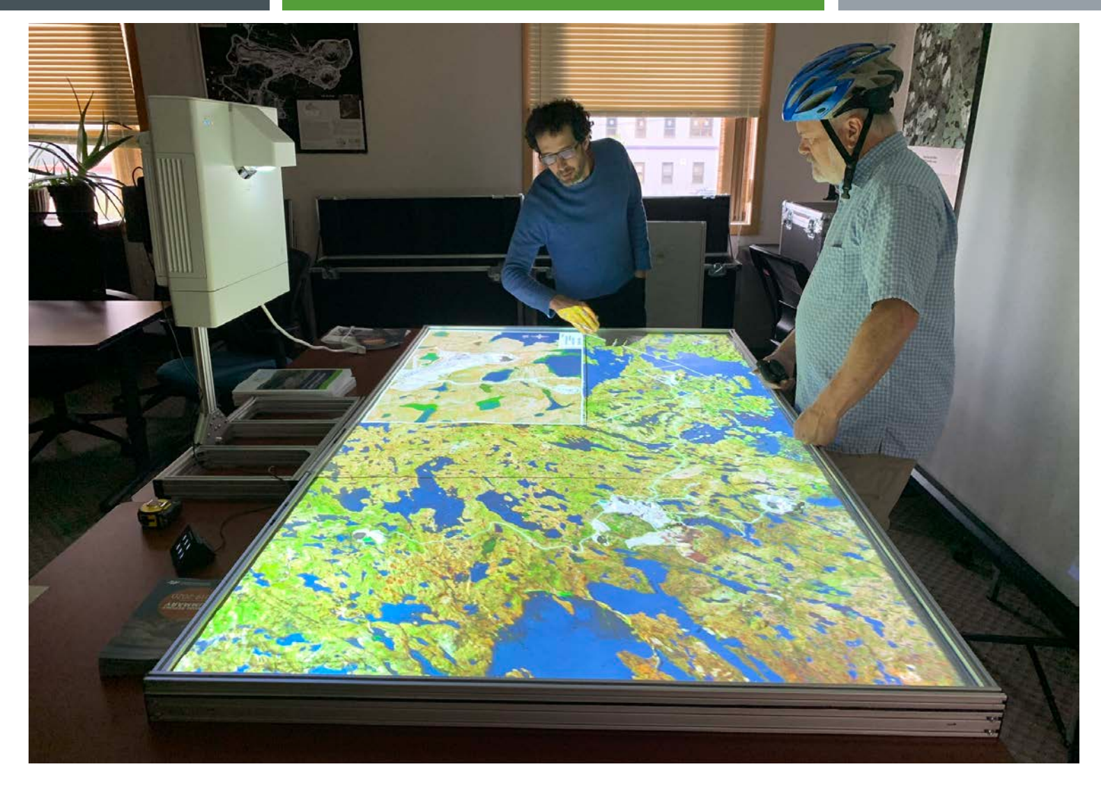
EKATI SITE MODEL