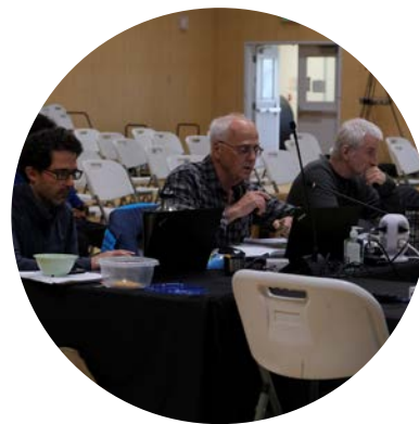
EKATI-SPECIFIC HEARINGS & WORKSHOPS