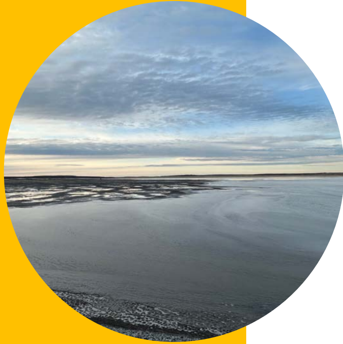
Long Lake Containment Facility