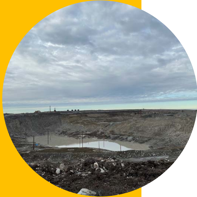
Point Lake Pit