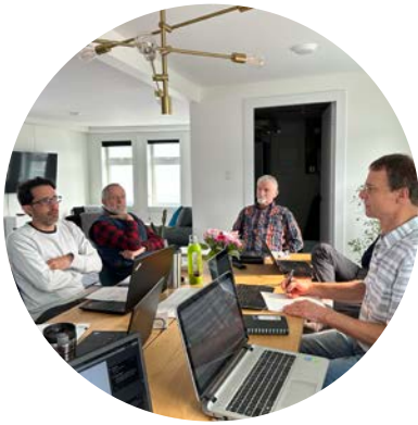
BOARD MEETINGS + SITE VISIT