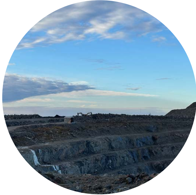
Sable laydown pad extension