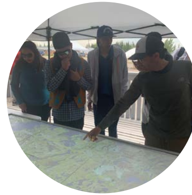
SITE MODEL UTILIZED