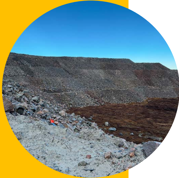
Sable waste rock pile