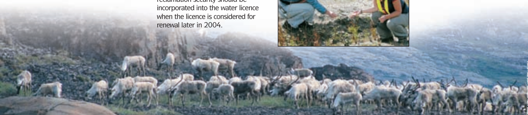
Bathurst Caribou herd

2. The monitoring of land breeding birds should be done every other year rather than every year.