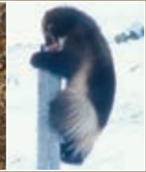
Left to right: Lake Trout; Wolverine DNA sampling station