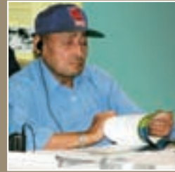
An elder reviewing the Agency's Annual Report