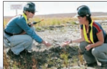
Reclaiming Fred's Channel at Ekati

5. The principles for progressive reclamation security should be incorporated into the water licence when the licence is considered for renewal later in 2004.