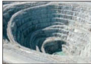
Panda Pit 2003

PHOTO: R. PATTENDEN MAINSTREAM AQUATICS LTD. PHOTO: ROBERT MULDER, GNVW