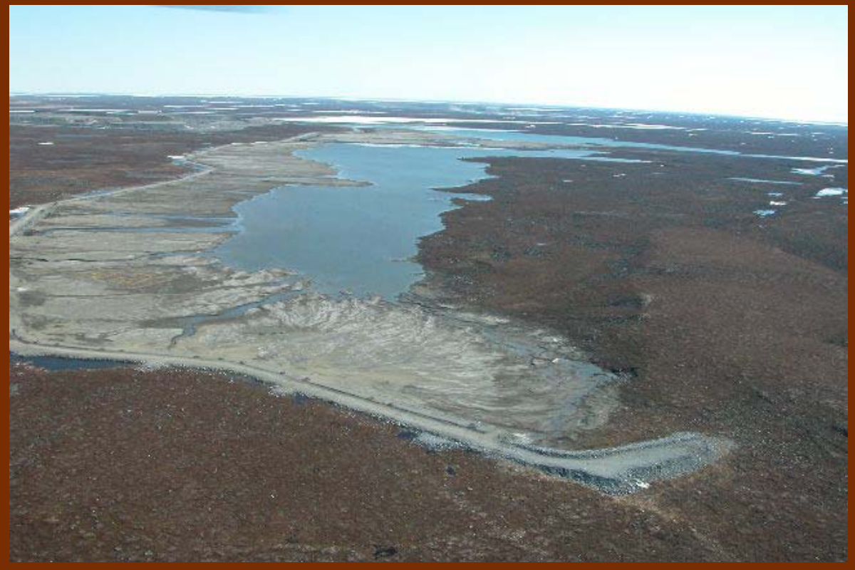
Independent Environmental Monitoring Agency