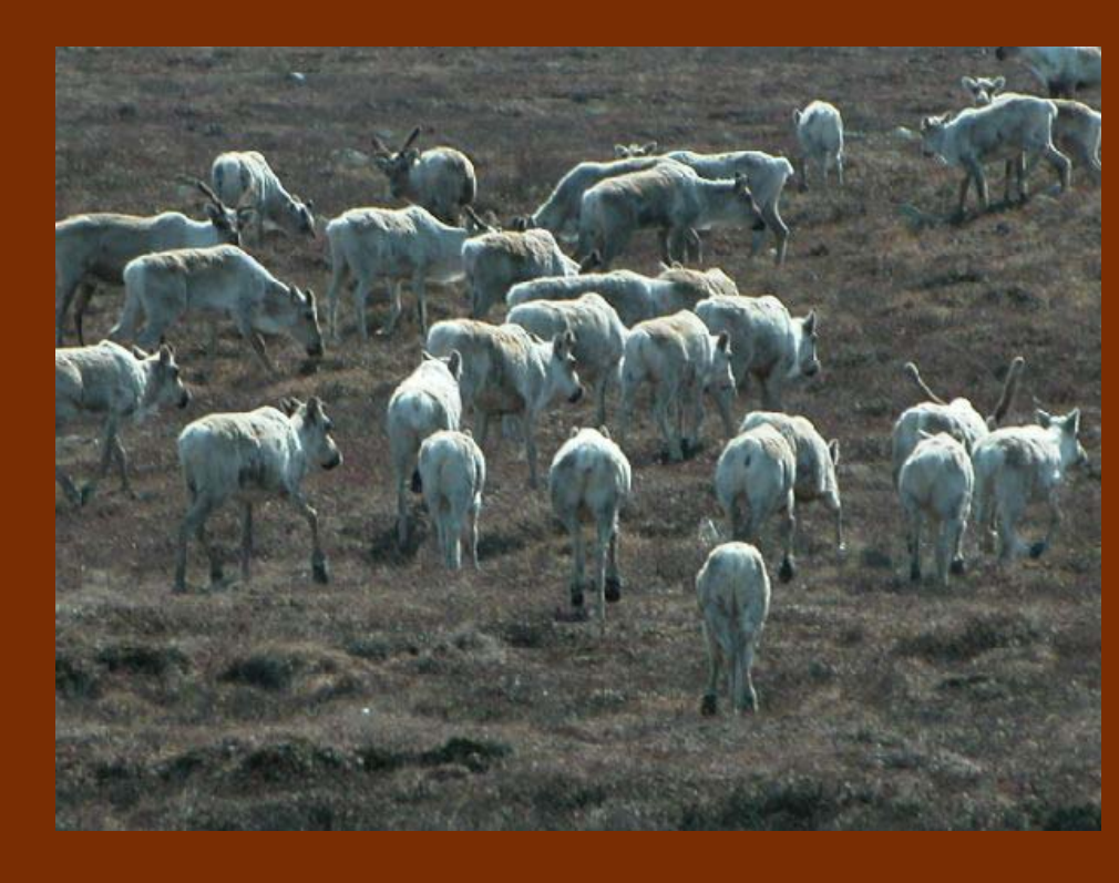
Caribou near Ekati, 2003

• DIAND, GNWT, GNU and BHPB should be involved in regional caribou monitoring of the Bathurst Caribou herd.