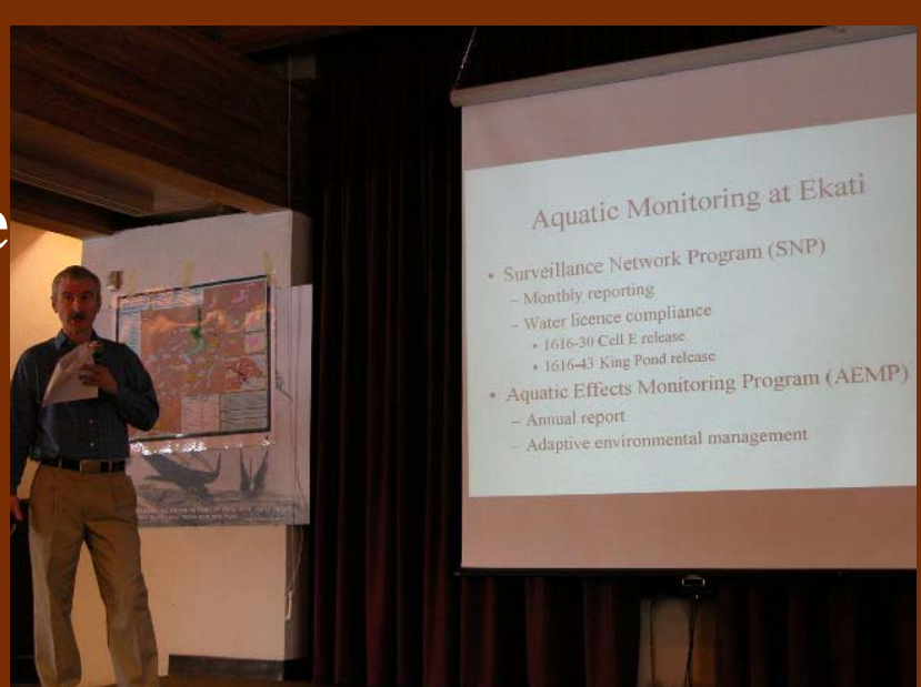
Ekati Environmental Workshop March 2005

Environmental Agreement BHP Billiton Diamond Project