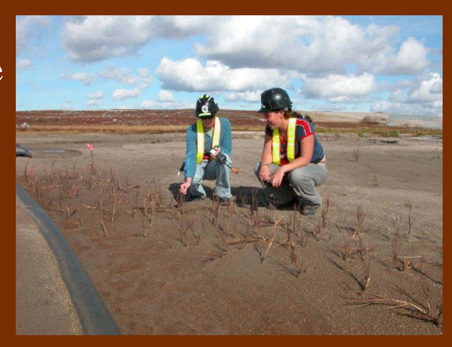
Reclamation at Fred's Channel, 2003

Decisions should be made about closure of mine components based on information from the corresponding studies in the forthcoming Abandonment and Reclamation research plan.