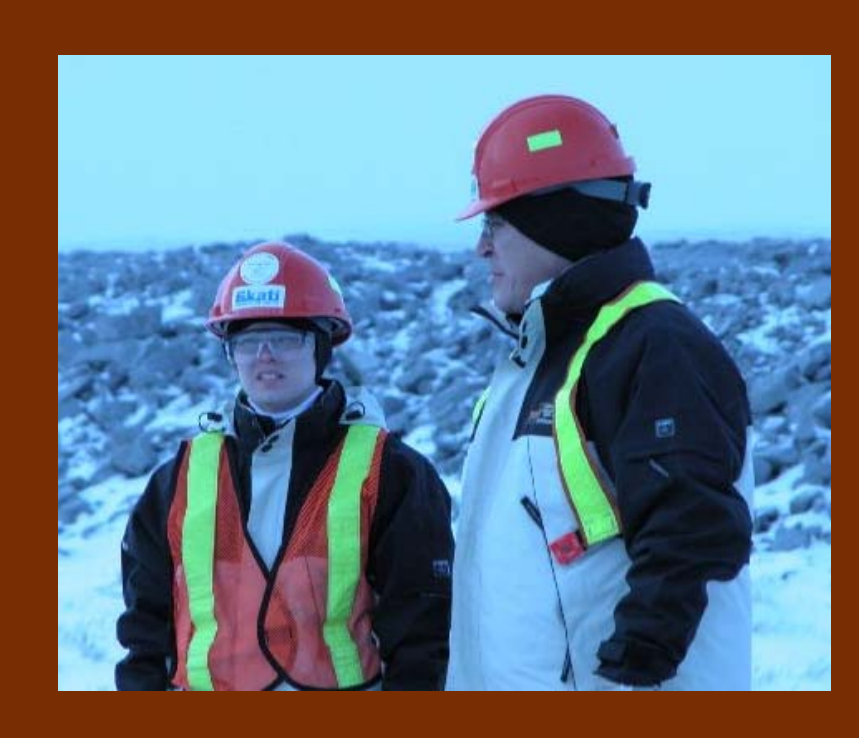
KIA delegates at the site tour in October 2004

• BHPB should develop a collaborative consultation process to assist in developing its next closure plan, similar to the process used for improving the operation of the Long Lake Containment Facility.