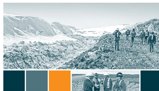
TECHNICAL ANNUAL REPORT 2012-13 A PUBLIC WATCHDOG FOR ENVIRONMENTAL MANAGEMENT AT EKATI DIAMOND MINE™

These versions can also be viewed online at www.monitoringagency.net under "agency documents and correspondence."