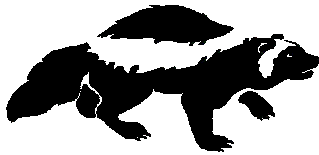
Independent Environmental Monitoring Agency (IEMA)